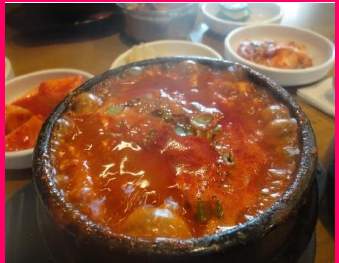
Soondoo-bu-jigae, a hot and spicy Korean speciality