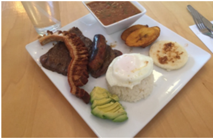
Bandeja paisa (beans, beef—ground or steak—, rice, plantain, chorizo sausage, avocado, egg, arepa and pork rinds).