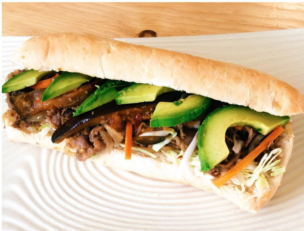
Pork and eggplant sandwich from Mogumogu

I hope you will try some of these restaurants so you can notice the difference between the authentic Japanese restaurant and the American Japanese restaurant.