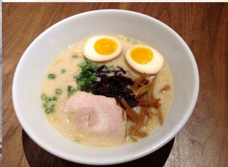
Ramen from Naruto

The second reason is that the dishes served in the United States are Americanized forms of Japanese food, or a fusion of Japanese and Western. The Japanese food and especially Washoku have the meaning of traditional Japanese cuisine. The California roll born in the 60s in Los Angeles is a good example. The California roll substitutes avocado for toro (fatty tuna) and makes the roll "inside-out." Traditionally sushi rolls are wrapped with nori on the outside, but Americans did not like seeing and chewing the nori on the outside of the roll. In addition, Japanese food now means