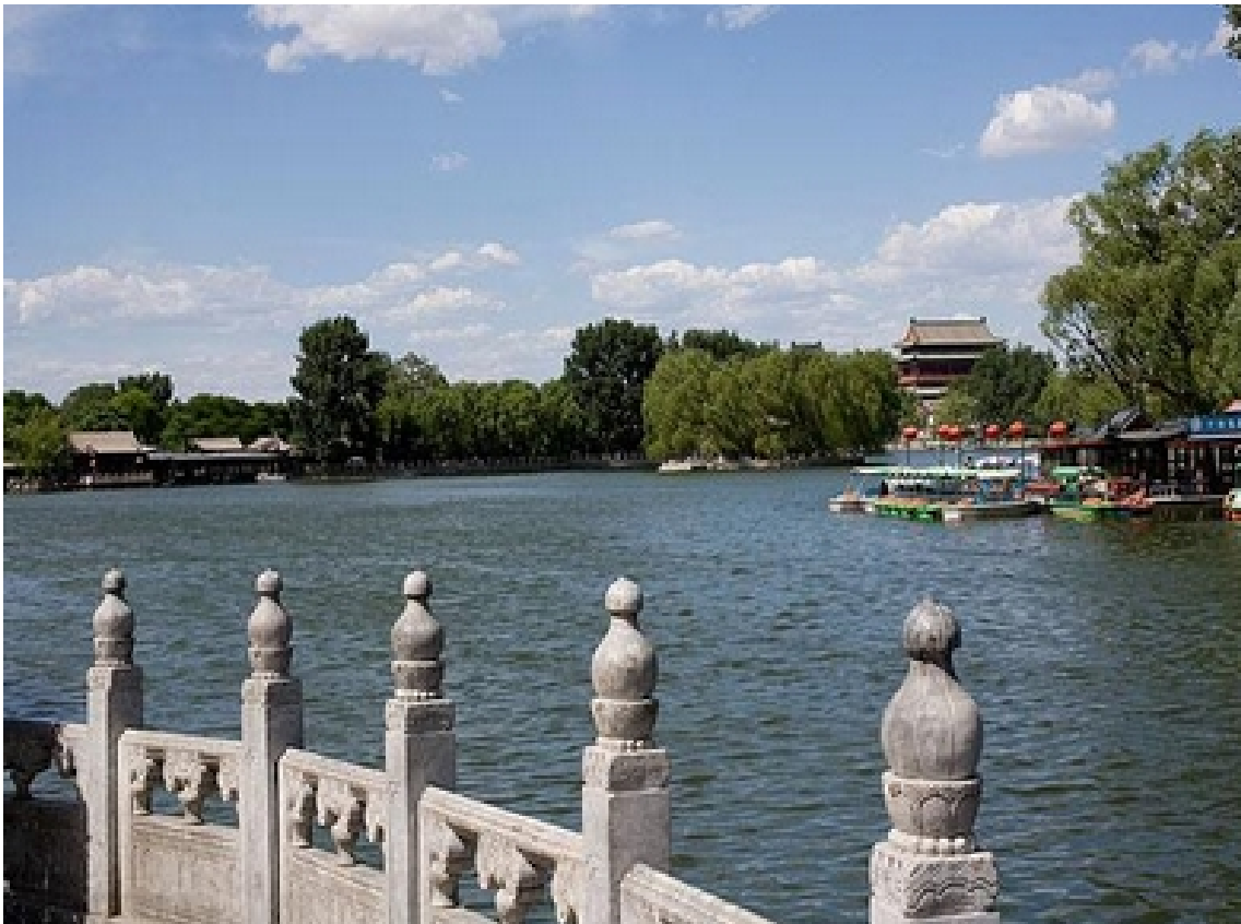
One of the three lakes near Drum Tower Street.

A visit to Drum Tower Street will allow you to see the culture of Beijing. The many attractive features and experiences create a day full of adventure that will be the highlight of anyone’s trip to the city of Beijing.