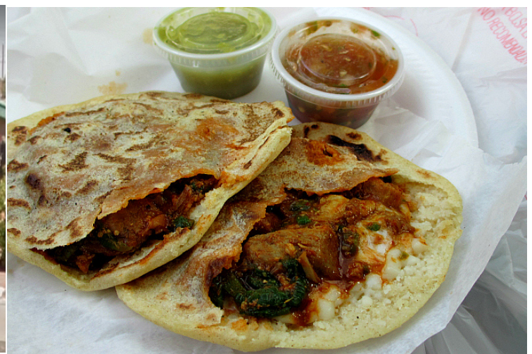
Ricas Gorditas Vale , 3311 Coors Blvd SW