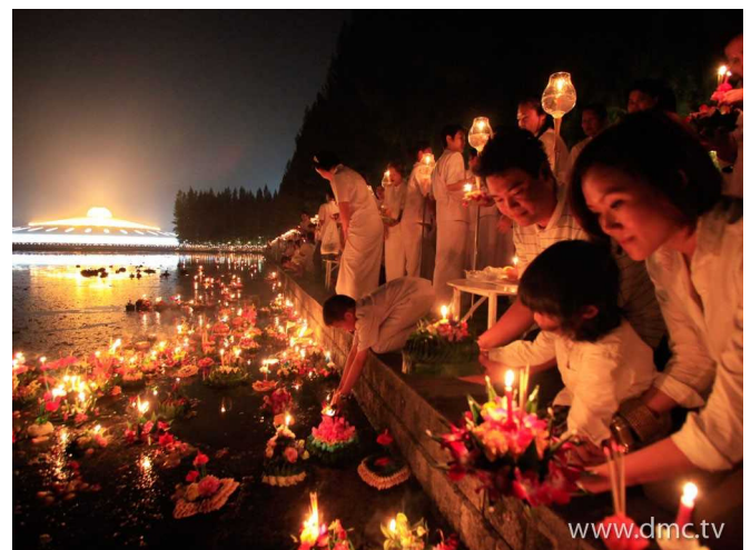
Floating lotus flowers to celebrate Lot Kratong

To summarize, every country has different festivals which have their reasons. No matter what, festivals still are important things for friendships. Thus, in my opinion, we should enjoy them and pass their traditions down to the next generation.