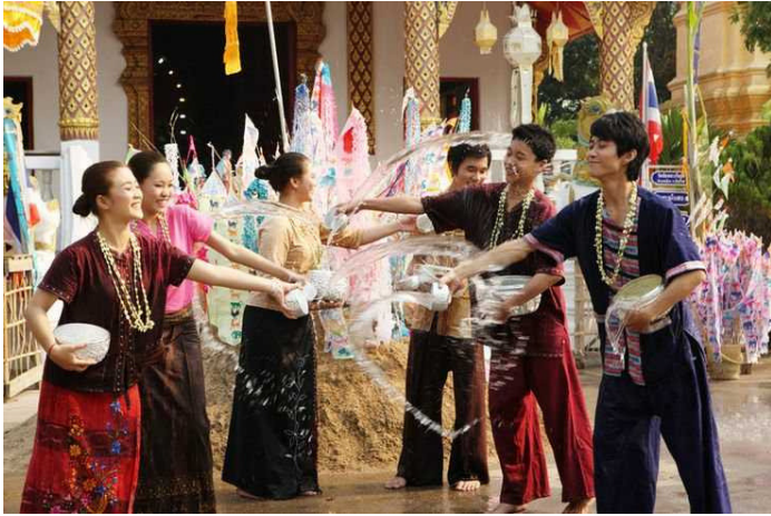
Celebrators of Songkran splash each other with water for good luck.

by Gap Tharawatcharasart (Intermediate Writing)